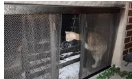
FUZZ GOES IN FIREPLACE