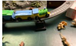
AN AMERICAN SUPPLY TRAIN DELIVERS SUPPLIES TO TROOPS