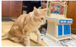
FUZZ: EMPEROR OF THE EMPIRE OF BABY BUEATS